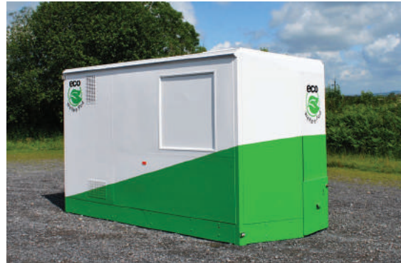
THE UNIT DROPPED AND SECURED