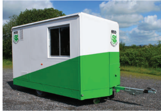
THE UNIT RAISED WITH THE TOW BAR OUT